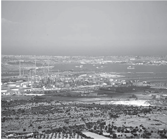
1. Melilli, landscape of the petrochemical pole.