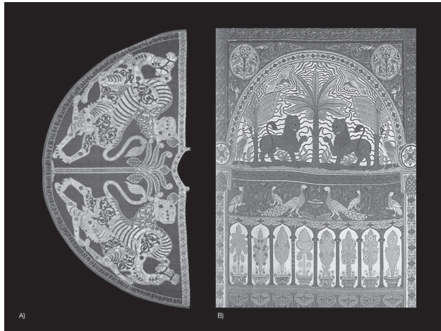
2. The recovery: tradition and innovation.

A) Palermitan manufacture, cloak of Ruggero II, 1133; B) Florio factory, tapestry with applications in coral.