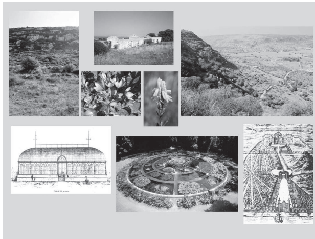
5. The Emotional park of the medical and dye herbs. From the right: the park area, some dyeing herbes and three examples of historical garden in Sicily.